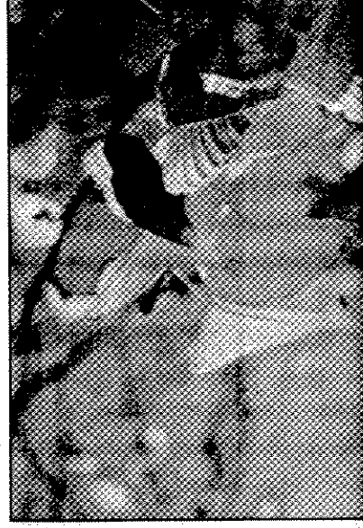
"Orange Hears" Mission Hill, Boston, MA

I have found many doorways into other worlds where magic is afloot."