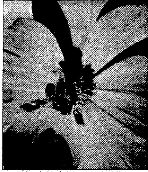
"Hungry Honey Bee" Mission Hill, Boston, MA