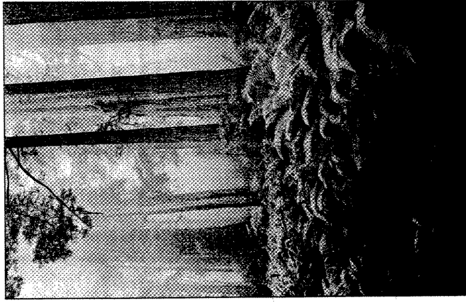
"Around the corner" Redwoods in fog, Redwoods NP, CA

Spiegel's art carries with it a message that, in this jaded world,